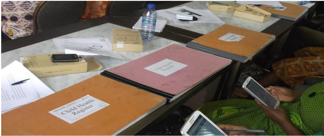
Figure 1. E-Tracker Training Session

With these sterling characteristics it was envisaged that implementation of the e-Tracker at the CHPS compounds/zones will facilitate provision of healthcare, address challenges in MCH data reporting and scale the DHIS2 to the community level. It was for this background that a two weeks boot-camp was held in July 2014 to design the system and to train end-users on its use. With support from the University of Oslo DHIS2 the technical team at the GHS undertook the customization of the e-Tracker. Healthcare officers from the Family Health (FH) Division also assisted in standardizing the data collection instruments before incorporation into the e-Tracker. This is because MCH services are under the purview of the FH division of the GHS. Because of data overlaps some indicators and data elements needed further clarification and redefinition before input into the e-Tracker.